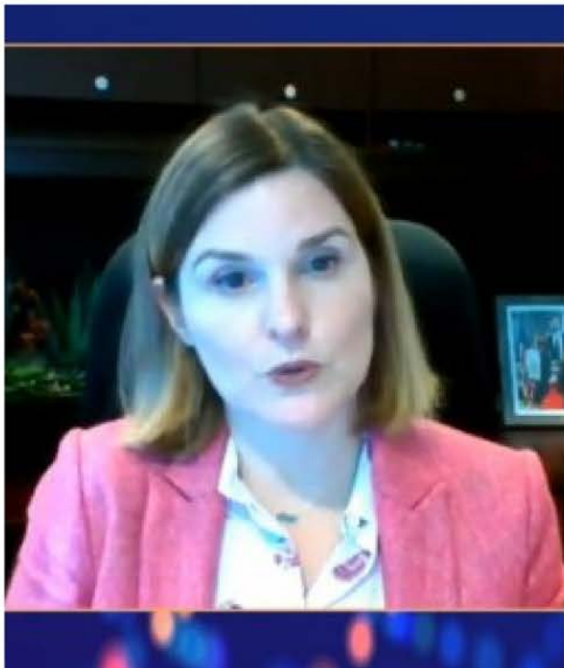
FERC Commissioner Allison Clements

This conference brought people together and encouraged collaboration around the common goals that environmental NGOs and industry share. The panels dug into key topics that must be tackled to successfully deploy large amounts of renewable energy that are needed to deliver a clean energy economy.