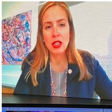
Senator Melisa Lopez-Franzen (D-MN)