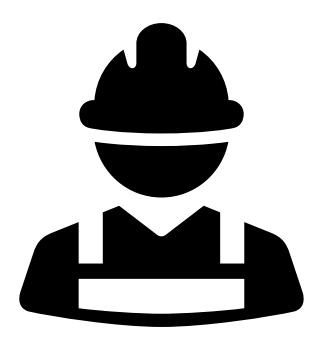
employment opportunities during construction and operation of a project