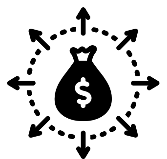
New spending infused into the local economy