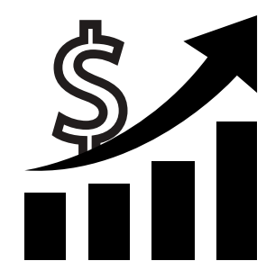
New tax revenue streams to rural communities

The new tax revenue streams can help pay for essential services: Local Schools Roads Police & Fire Services