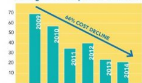
Average levelized price of wind PPAs

Numerous reports show wind energy is increasingly cost competitive when compared to other new sources of generation. In many parts of the country, particularly in the Midwest, wind is often the cheapest source of new energy capacity. That's why utilities and corporate purchasers are investing in wind. They're scooping up bargains, and why shouldn't they? The best part is that when they do, we - the consumer - benefit from that free fuel in the form of lower electric bills.